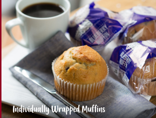
Individually Wrapped Muffins