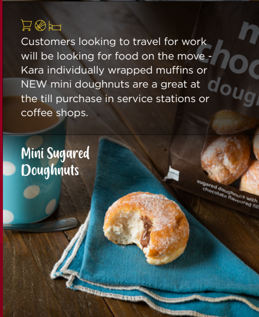
Mini Sugared Doughnuts

Customers looking to travel for work will be looking for food on the move - Kara individually wrapped muffins or NEW mini doughnuts are a great at the till purchase in service stations or coffee shops.